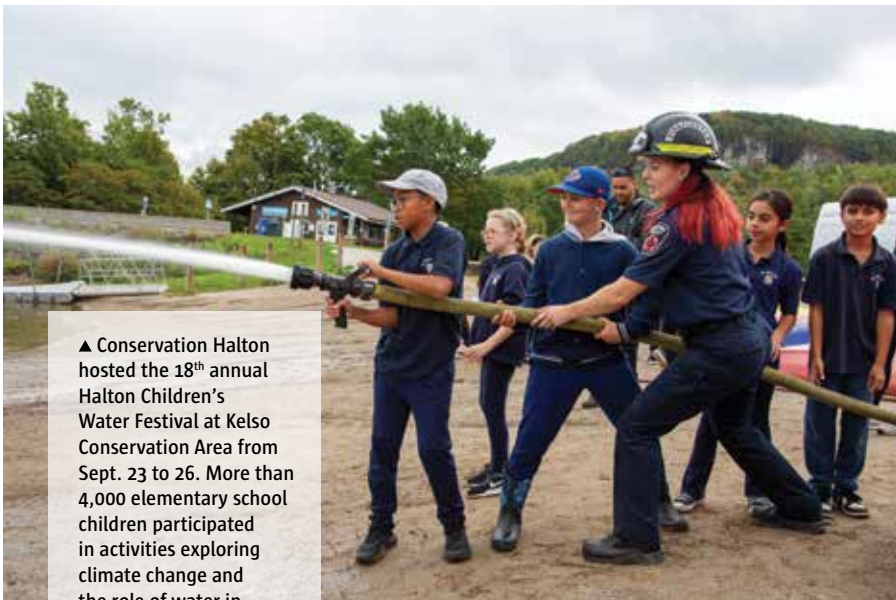
▲ Conservation Halton hosted the 18 th annual Halton Children's Water Festival at Kelso Conservation Area from Sept. 23 to 26. More than 4,000 elementary school children participated in activities exploring climate change and the role of water in communities and local ecosystems.