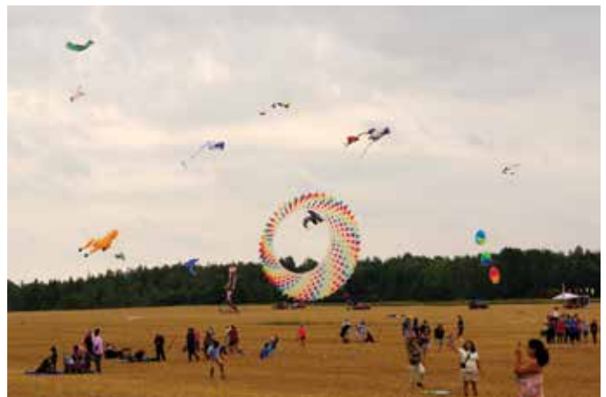
▲ Hopeville Kite Festival was held August 23 & 24.

▲ In August in Norval, and again in September in Glen Williams, Georgetown Little Theatre presented Olde Tyme Nites , a celebration of community, music and laughter, featuring the character of Lucy Maud Montgomery, once a resident of Norval.