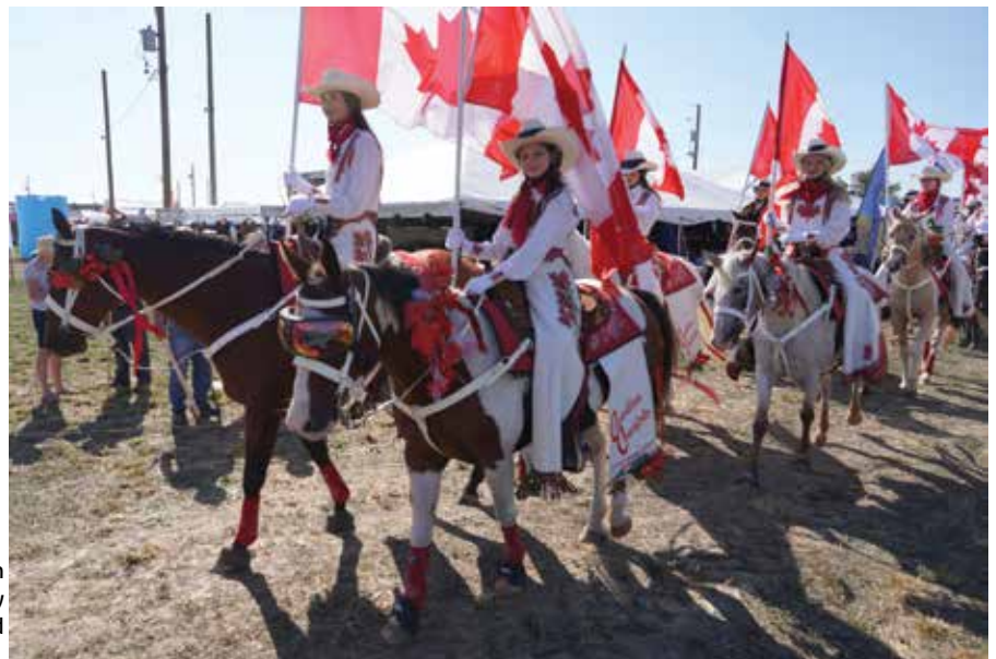
► Canadian Cowgirls Rodeo Drill Team from Chatham-Kent participating in the opening day parade at the International Plowing Match, held this year in Grassie on Sept 16.